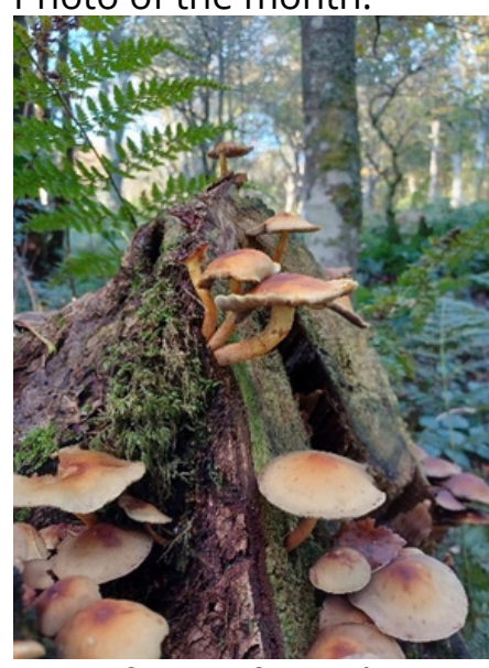
Fungi from a fairytale